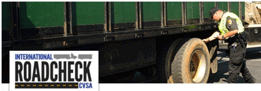
The Commercial Vehicle Safety Alliance's (CVSA) 29th annual International Roadcheck will take place June 7-9, 2016.